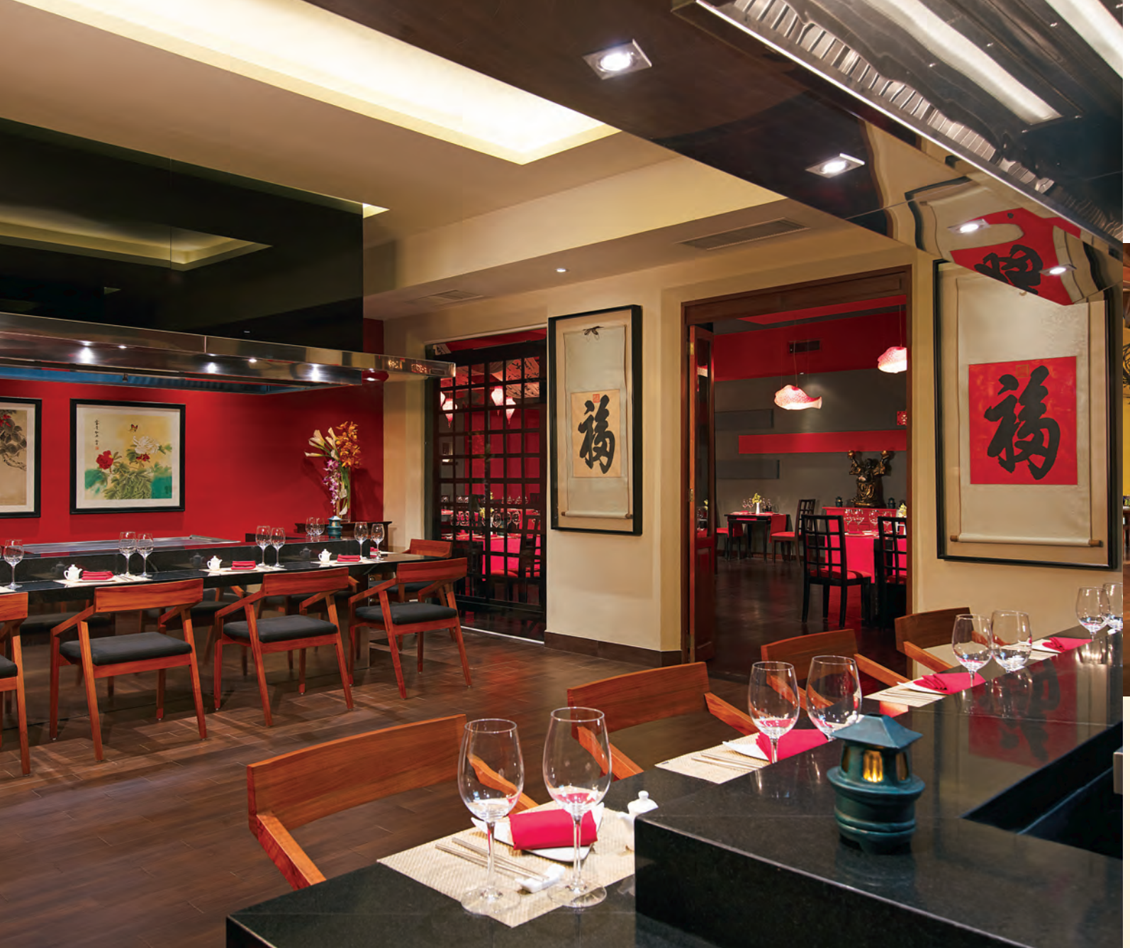
SAVORY Sensations . One of the great joys of your Unlimited-Luxury<sup>®</sup> privileges is the inclusion of your eight dining choices and a cozy café. Himitsu is a gastronomical heaven for exquisite Thai and Chinese specialties.