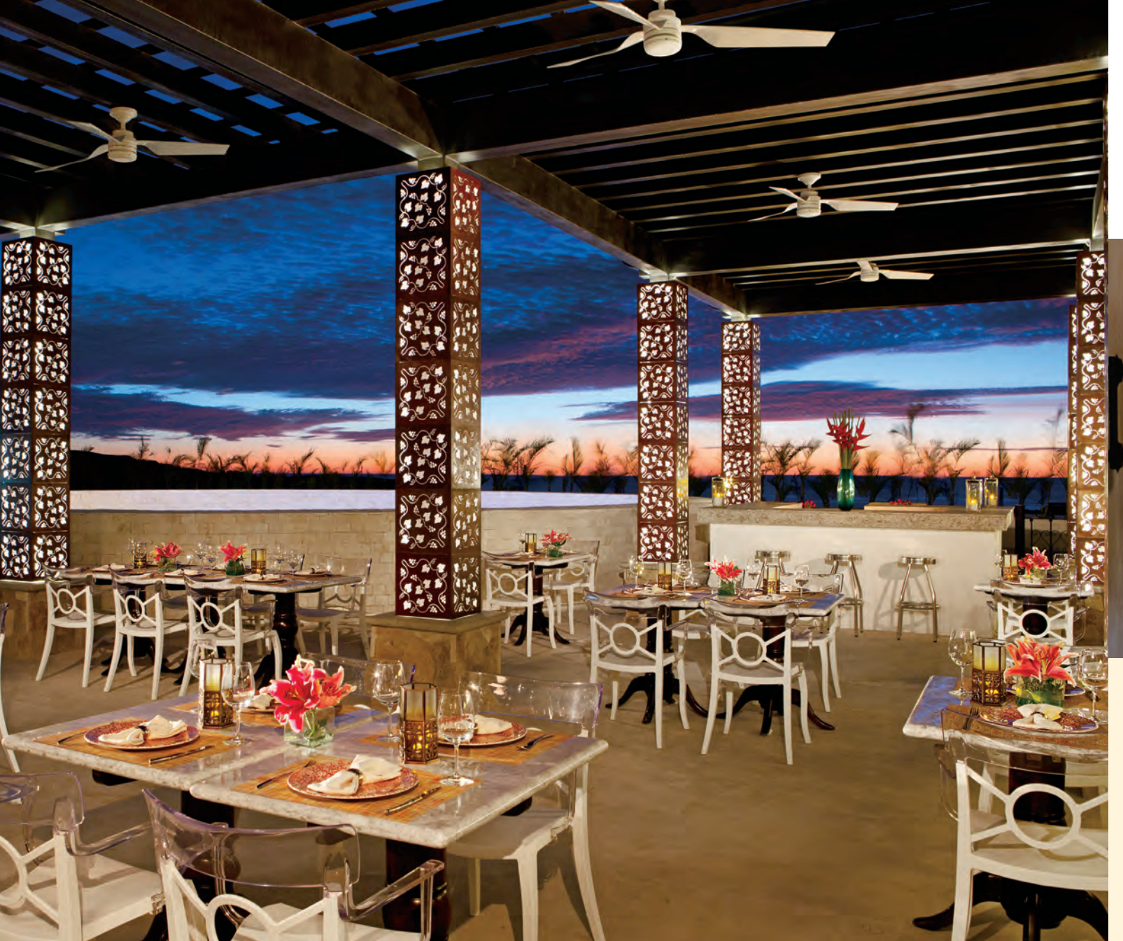
GLORIOUS Gourmet. Five global gourmet restaurants will cater to your culinary cravings as often as you wish, without reservations or expected gratuities. Likewise for our international buffet, luscious grill, coffee café and unlimited premium brand bars and lounges.